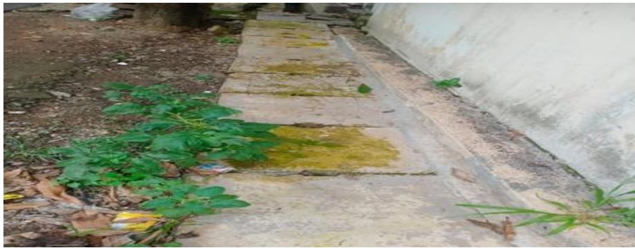
Figure 2. Condition of existing drainage channels

Figure 2. shows the drainage channels that function as rainwater and surface runoff channels. The existence of these drainage channels is very important to prevent water pooling on surfaces and roads and to ensure that the air conditioning system in the surrounding area functions properly.